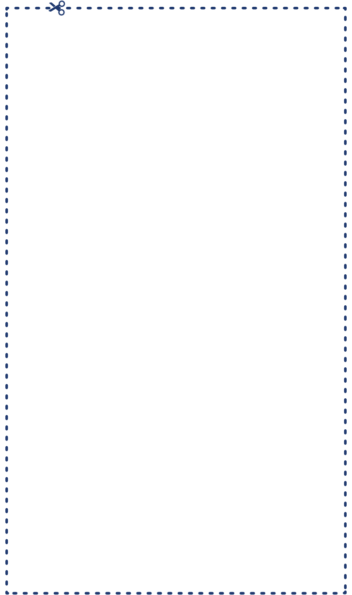
SIDE PANEL 2