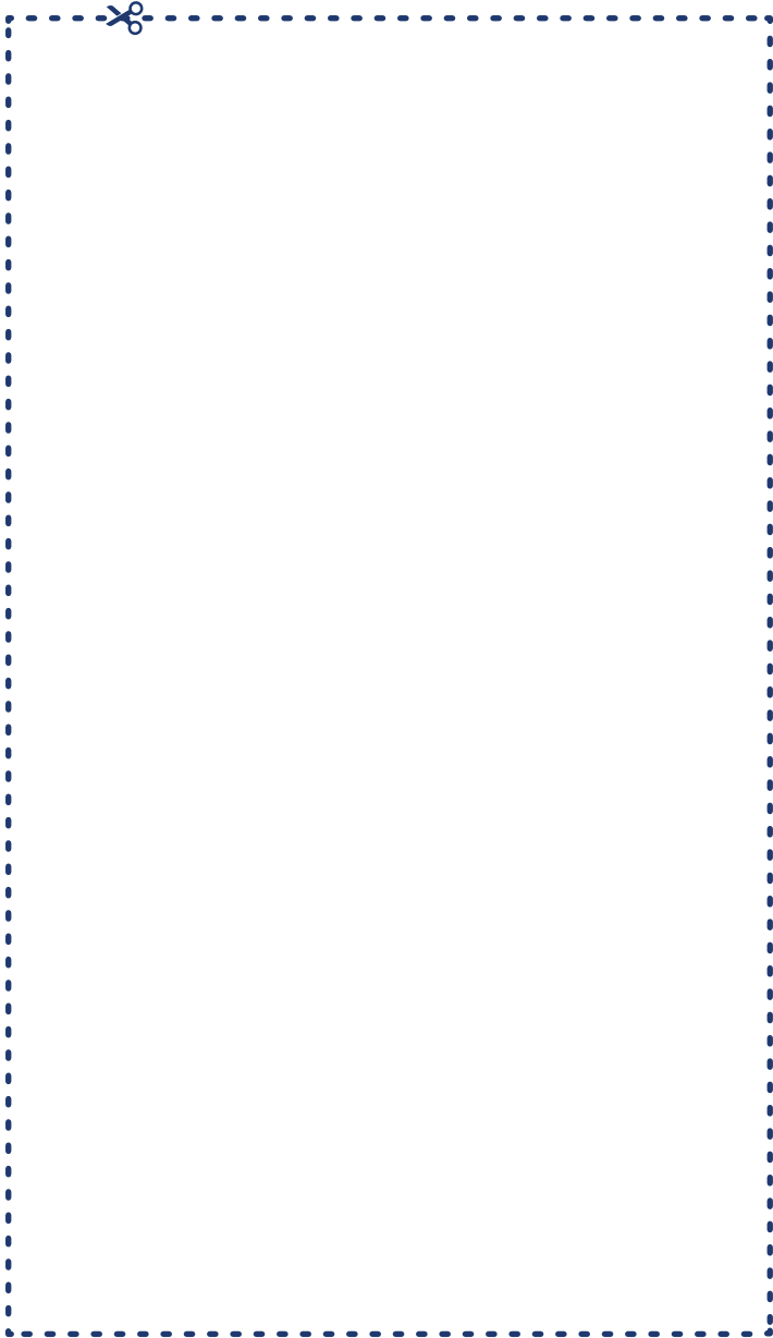
SIDE PANEL 1

TEMPLATE TO CUT OUT YOUR PANELS TO DECORATE